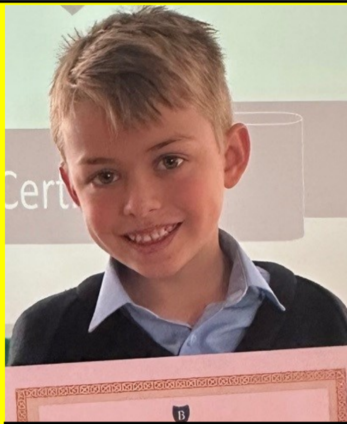
CONGRATULATIONS JENSON SCIENCE AWARD